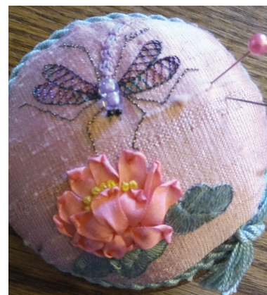
Dragonfly on Waterlily pincushion

Mon, Dec 5 – Toni Gerdes Additions to Stitching