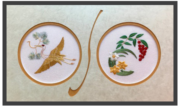
Happy Anticipation and Nandina/Daffodil Circles © Japanese Embroidery Center Stitched by Christene Thurston

Many motifs used in Japanese Embroidery express specific meanings or celebrate special occasions. The crane is one of the most notable designs recognized on Japanese kimonos and other Japanese products. It represents new life and long life. Pine is an auspicious symbol of endurance, good luck and happiness. Flowers and all plant life are used to depict the different seasons. The narcissus announces the arrival of spring, bringing the year full circle; wisteria is typical of June and the morning glory is representative of late summer. Rice, an important harvest, is used to imply autumn.