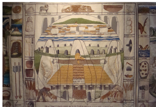
Panel from the Great Tapestry of Scotland.