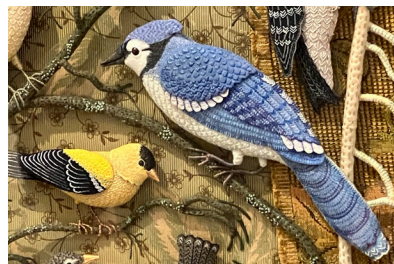
Above: Detail from Rabbitat .