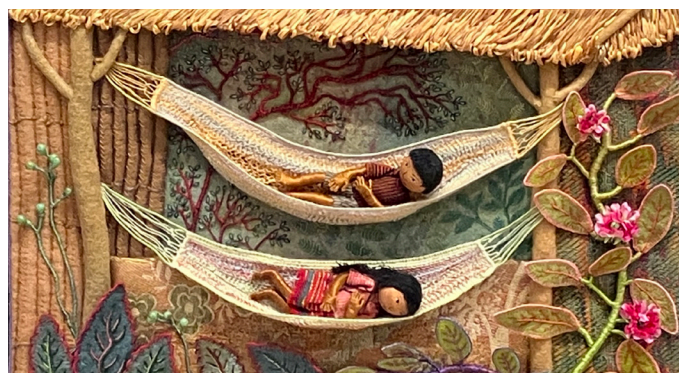
Below: Artwork for My Bed, Enchanting Ways to Fall Asleep Around the World .

Largest Selection of Cross Stitching Supplies in Dutchess County