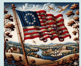
Design for Georgia Panel